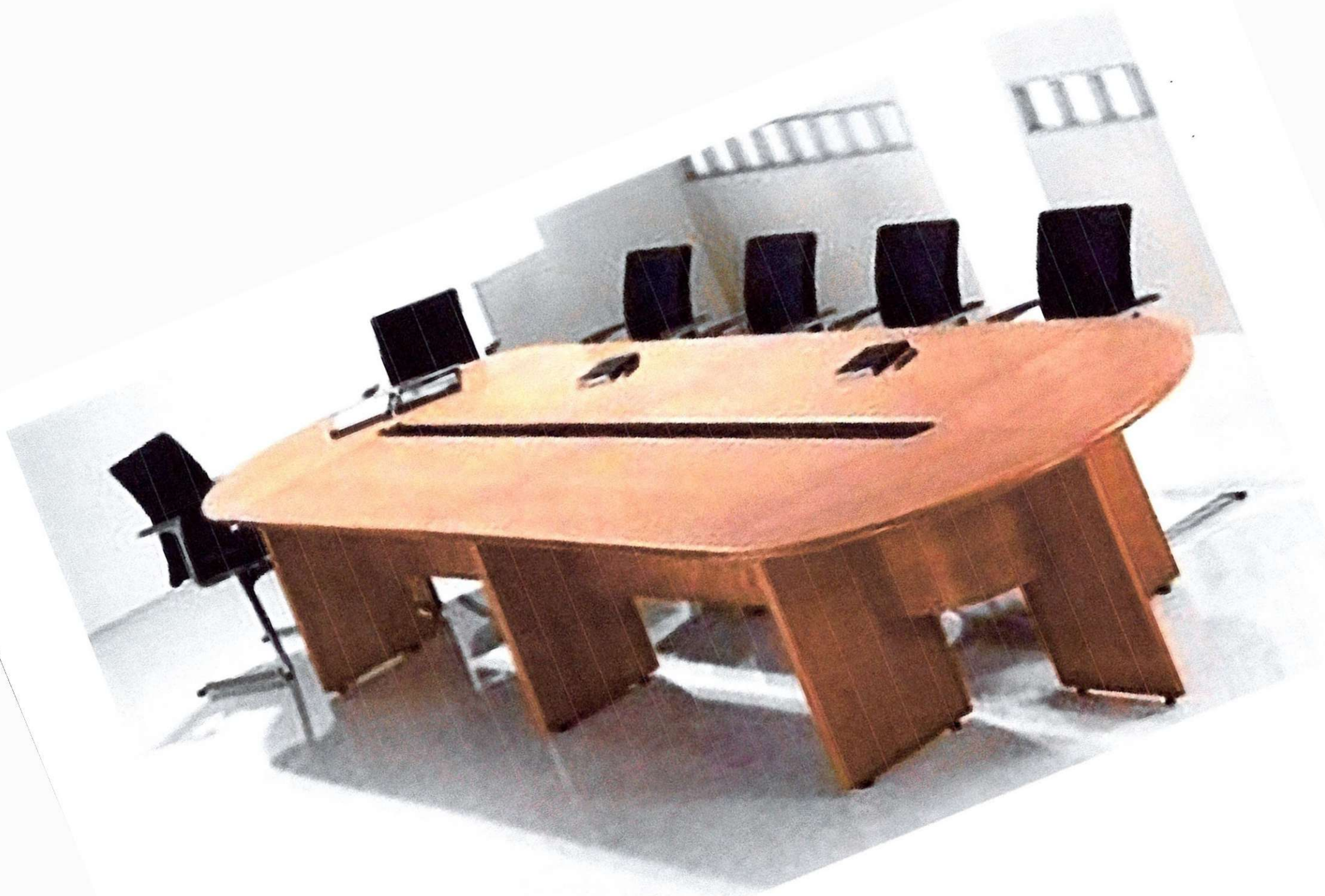
Conference Table Cot- 21