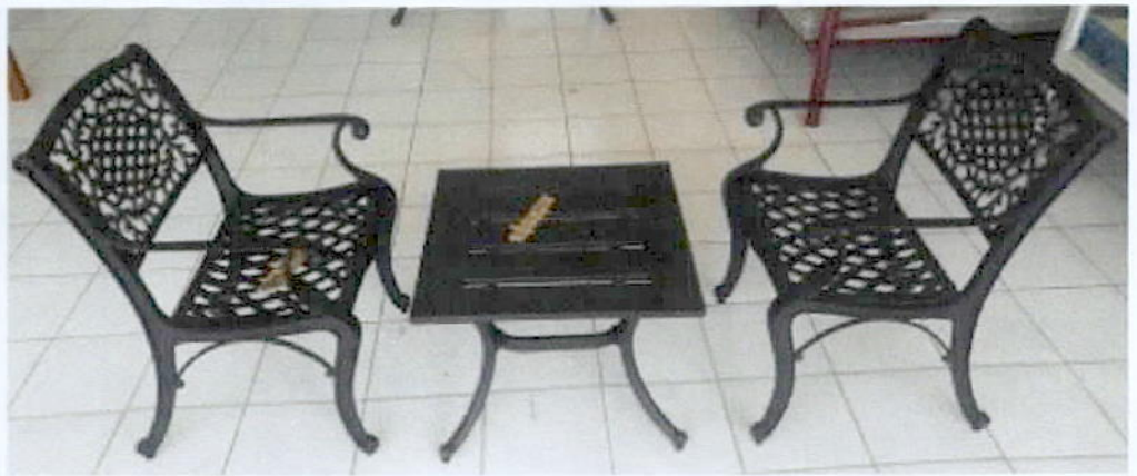
2 pcs. Armchair 1 pc. Center Table