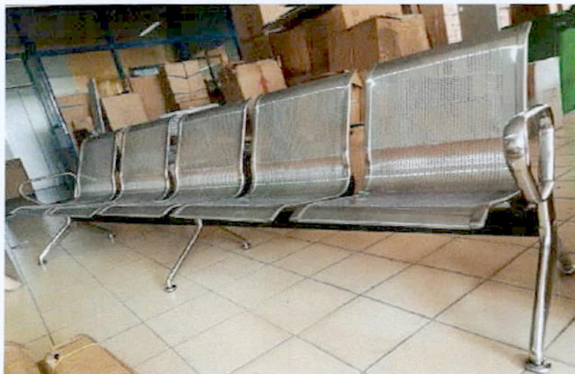
5 Seater Stainless Gang Chair