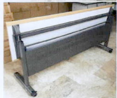
Folding Training Table