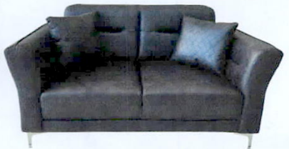
Sofa/Sala Set - Leatherette