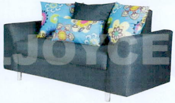
Sofa/Sala Set - Fabric