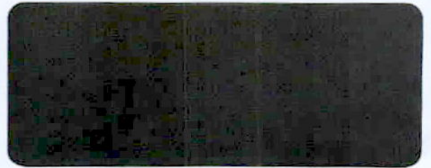
High-Quality Plastic 6ft. Stacking Folding Table